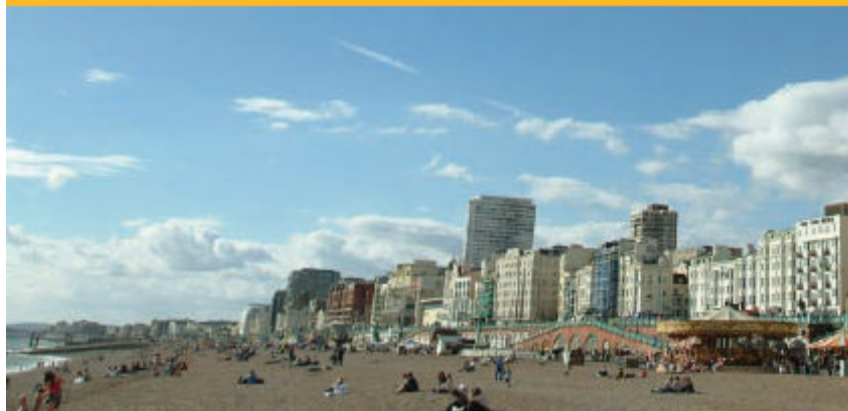
Spending time on Brighton Seafront

Protect the environment while growing the economy